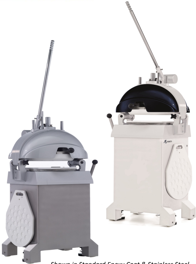
Shown in Standard Epoxy Coat & Stainless Steel