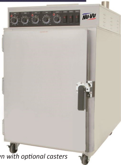
Shown with optional casters