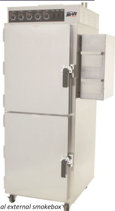
Shown with optional external smokebox